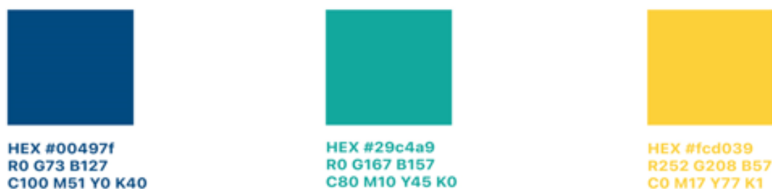
Figure 5 – RadoNorm basic colours