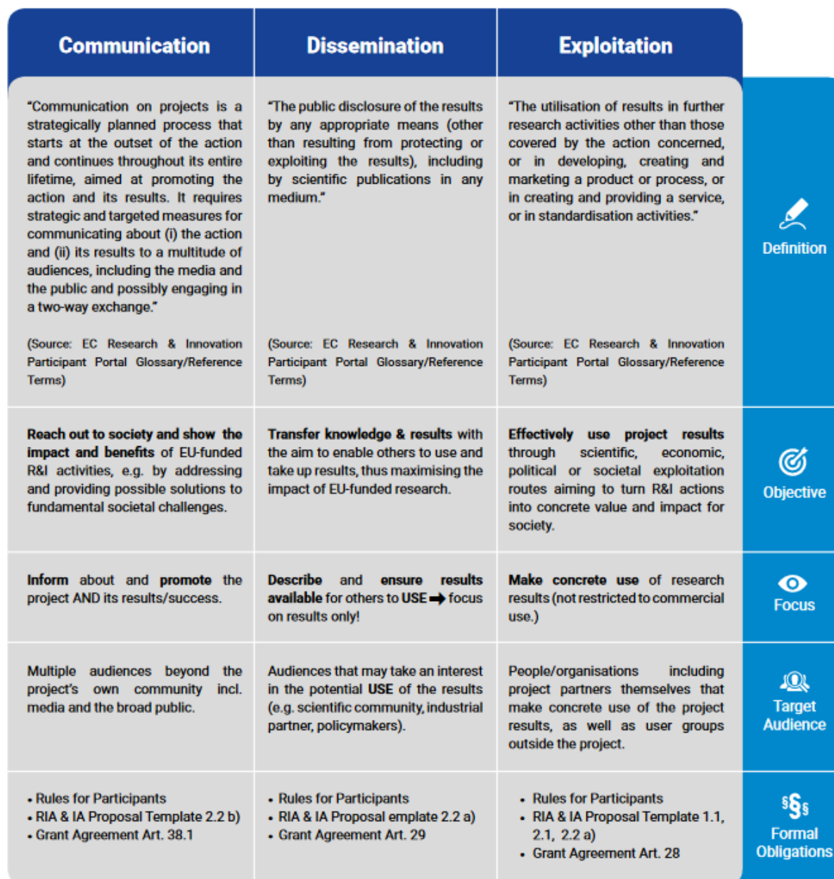
Figure 1 – Communication/Dissemination/Exploitation definitions and distinctions [2]

The definitions and distinctions between the terms communication, dissemination and exploitation of results are given in Figure 1 Communication/Dissemination/Exploitation definitions and distinctions , as presented in the European IPR helpdesk publication [2].